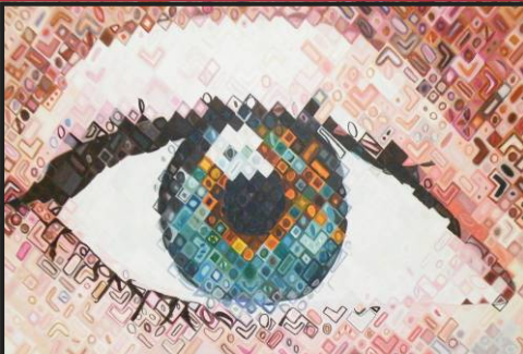
By Libby Keen - 13SJL

As well as the evening activities there were open workshops for students to try their hand at street dancing, Drama or 'Sing Star'.