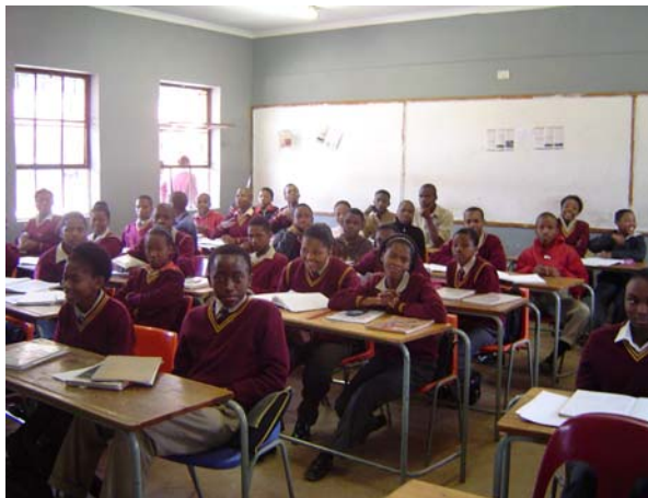
A Grade 10 (Y10) Maths class. Approx. 50 'learners'

Miss Marshall and I travelled to the school in October to meet the staff and pupils for the first time and to try to learn as much about our partner school and its locality as possible. Mosupatsela School has 1800 students (learners) who are generally aged 13 to 18 years old but some are a little older, with 60 teachers (educators).