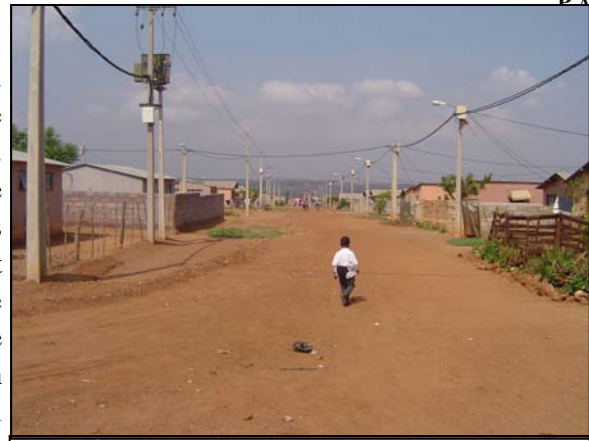
Road in Kagiso Township

total population of nearly 200,000 and there are six secondary schools. Learners often have to walk a long way to school—one girl that we met walked 6 miles to and from school everyday!